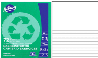
½ plain and ½ interlined

**Recommendations: Labeled lunch kit and containers for food storage. We are making a concentrated effort to have garbage free lunches.